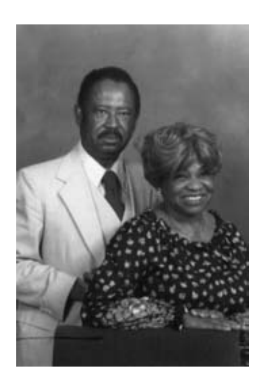
The Happy Couple