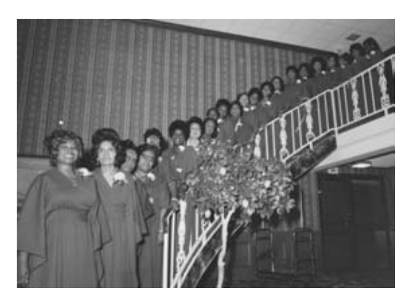
The Fabulous Zetas