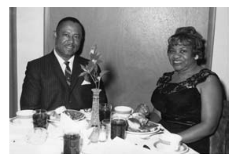
Christmas Celebration at Mississippi Vocational College (1965)